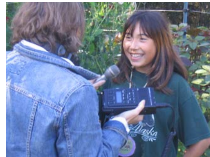
Student Gardener being interviewed by APRN