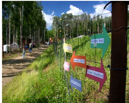
2006 Open House

The Annual Benefit Dinner and Auction took place at Pike's Waterfront Lodge this year. The event was our most successful fundraiser ever!