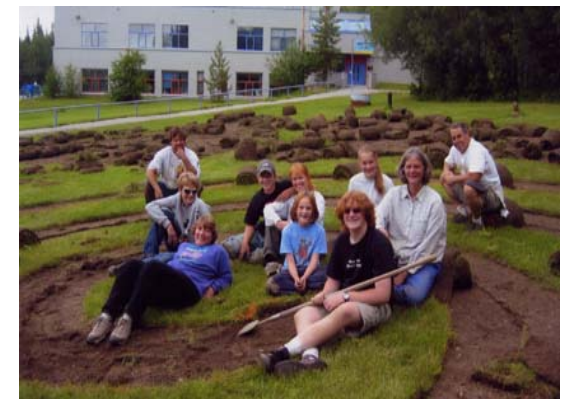
Pearl Creek School Garden Site