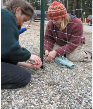
Fence building at U-Park

The Schoolyard Garden Initiative is a network of schoolyard gardens which function as outdoor learning environments during the school year and production gardens during the summer months. There are currently three schools with active gardens and three schools in the planning phase.