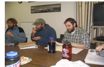
Board Meeting and eating