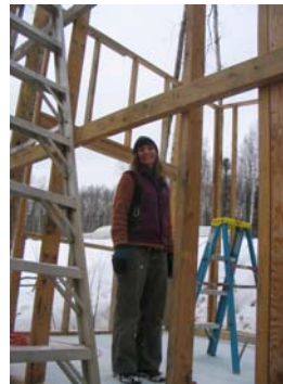
Employee Housing under construction