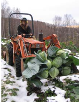
Fall Cabbage Harvest