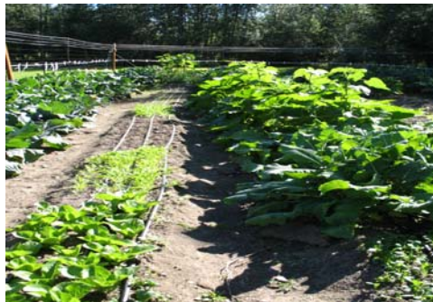
Student Garden at EKCS