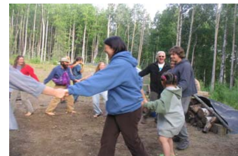
Square dancing at the Membership Picnic

● Approximately 70 Calypso members attended the Membership Picnic this year. The event offered opportunities to explore the farm, socialize, feast on homemade dishes, listen to live old time music and participate in a square dance.