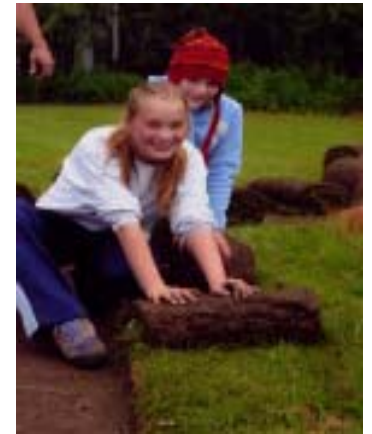
Garden creation at Pearl Creek School

● At Pearl Creek Elementary School, the garden committee worked hard to determine a garden site, create a garden design and raise funds to cover garden start-up costs. Their huge effort culminated in ground breaking during the summer of 2006. They ripped sod, tilled and planted a cover crop in their new garden!. Additionally, students and teachers participated in a school-wide compost pile building effort. They will plant a simple garden for the 2007 summer while focusing on moose fence construction. The EATinG program will maintain a CSA program at Pearl Creek beginning in the summer of 2008.