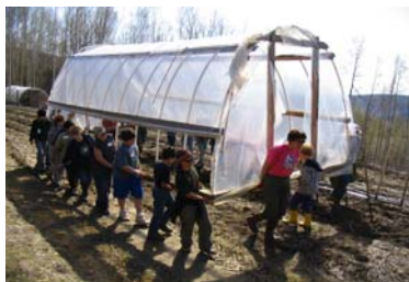
Students at work on the Farm

Calypso's fall field trip program included a Natural Dyeing field trip, during which students used garden-grown indigo and marigolds to produce brilliant blue and yellow bandanas. The pizza making field trip focused on local foods offered students the opportunity to harvest vegetables, mix pizza dough, and make goat cheese before creating their own personalized vegetable pizza.