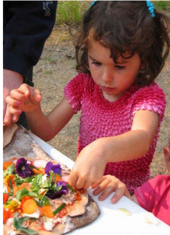
Fall Field Trips

More than 1450 elementary and middle school students visited Calypso in 2006 for farm-based field trips focused on farming and the boreal forest ecosystem. Field trip topics offered this year included: