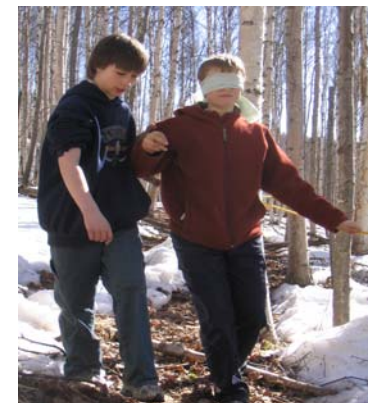
Spring Field Trips

"Giving children the chance to get involved with more than just looking on the garden tours was great! I would not change a thing. You have mastered the skills of organizing groups of children. Thank you very much!"