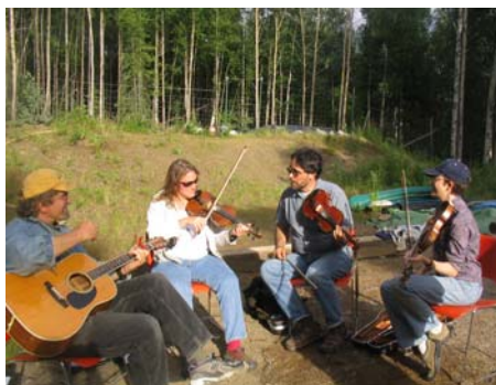
Old-timey Music at the Picnic

Everyone had a great time at the annual membership picnic this year! Attendees enjoyed a delicious potluck dinner, live music and an even livelier square dance.