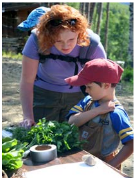
Taste Testing at the Open House

This year's Open House featured hands-on activities for the whole family, a farm stand, garden tours, and pizzas fresh from the wood-fire oven.