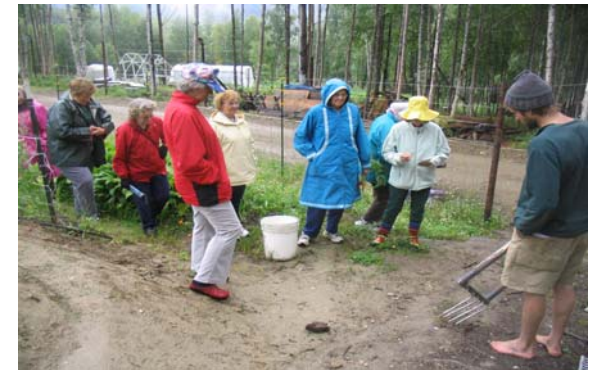
A local Garden Club tours the Farm