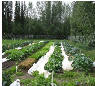
Garden at EKCS

The Schoolyard Garden Initiative is a network of schoolyard gardens which function as outdoor learning environments during the school year and production gardens during the summer months. There are currently three schools with active gardens and three schools in the planning phase.