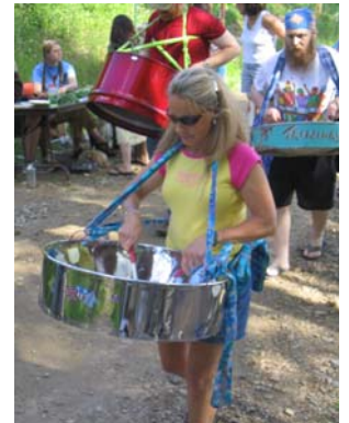
UAF Steel Drum Band at the Open House

● More than 260 people attended the 2006 Open House, with 24 volunteers assisting visitors in exploring the farm. The UAF Steel Drum Band played spectacular "Calypso" music which floated across the whole farm. Attendees and volunteers all had a great time!