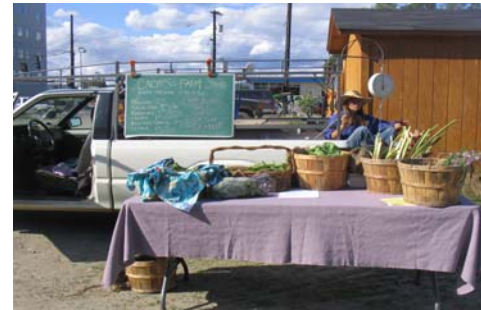
Downtown farm stand

● A range of groups toured the farm this spring and summer, including several gardening clubs, University class groups, and individuals and families.